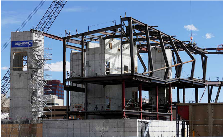
GE Johnson Construction Co. is CMAR/GC on the U.S. Olympic Museum in Colorado Springs, Colo., which is scheduled to open later this year.